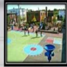
PLAY SCHOOL AREA