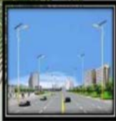
BLACK TOP ROAD